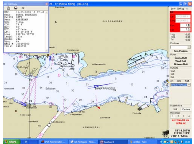
Example how AIS can be presented in a Electronic Chart System

Frequency : AIS1 161.975 MHz AIS2 162.025 MHz Sensitivity : -112dBm Antenna impedance : 50 ohms